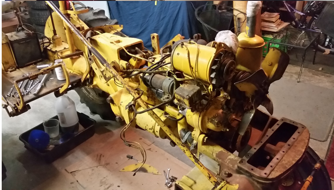
“After” Mitchel’s repair job!