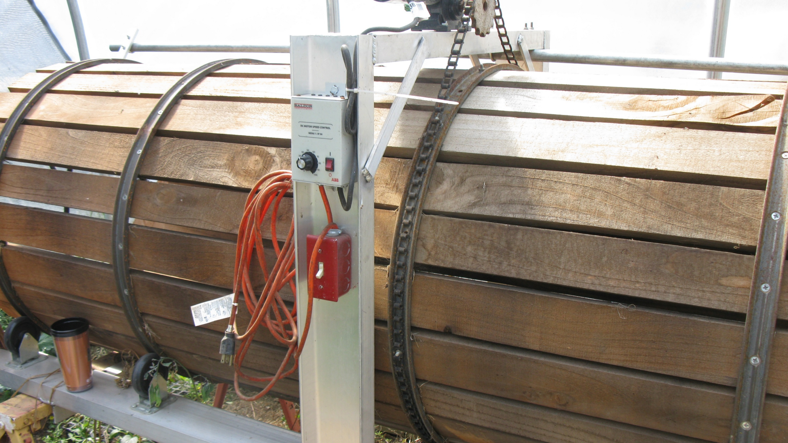
ABB DC MOTOR SPEED CONTROL MENA 1 / IP 30 ABB